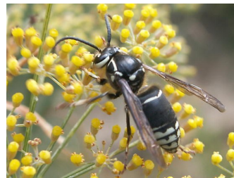
Bald-faced Hornet ( Dolichovespula maculata )