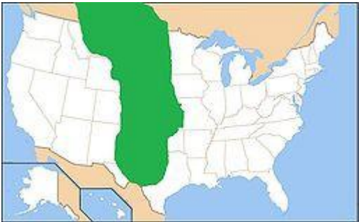
Map of the Great Plains [1]