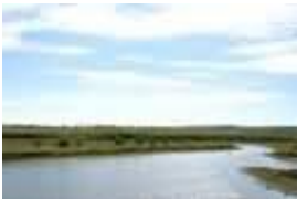
View of the Great Plains near the Missouri River of Montana

http://library.ndsu.edu/exhibits/text/gr eatplains/text.html