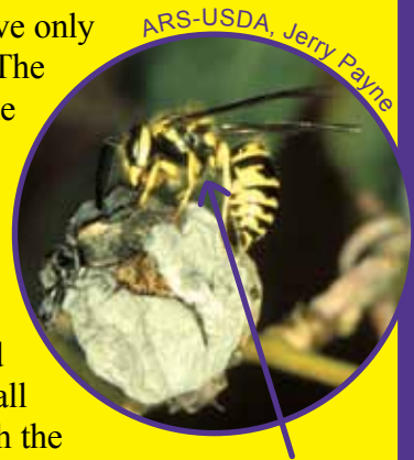
"Wasp waist" on paper wasp.

Some species of the yellow-faced bees live only in certain areas of the United States. The Hylaeus lunicraterius lives only at the area called Craters of the Moon in Idaho. Another of the Hylaeus genus is native only to Hawaii. Even though there are visual similarities between the yellow-faced bee and wasps, there are also many differences. Wasps have something called a "wasp waist" which resembles a small skinny joint connecting the abdomen with the thorax. Wasps also make paper nests, as this wasp is doing in the photograph.